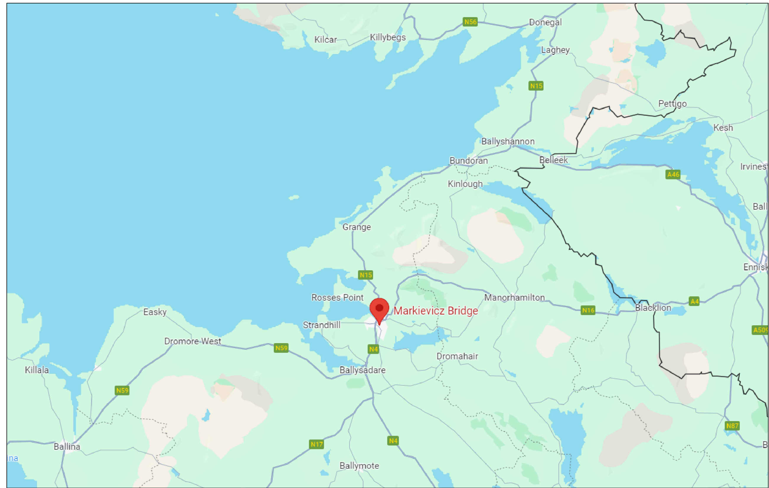
MARKIEVICZ BRIDGE LOCATION N.T.S