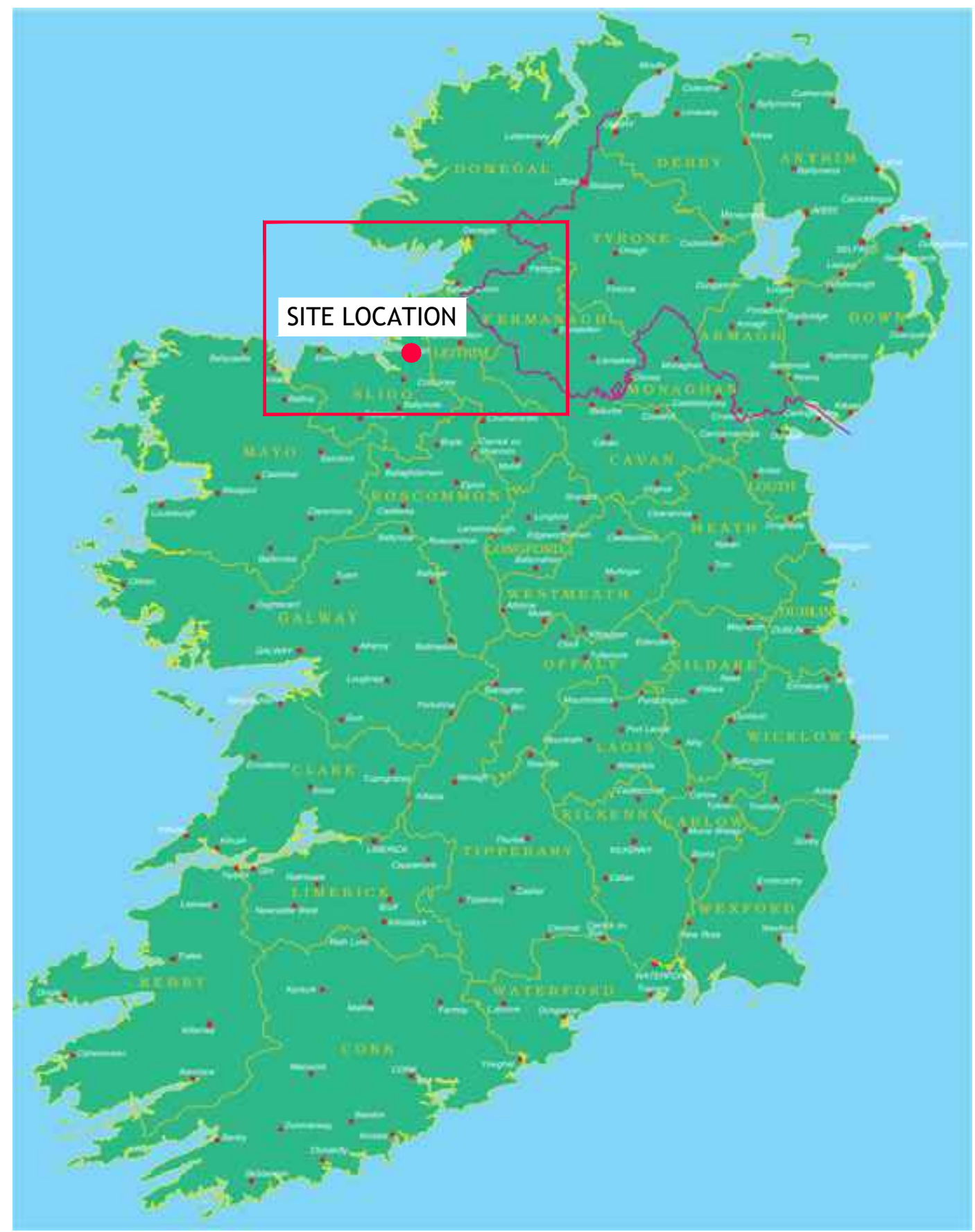
MAP OF IRELAND LOCATION N.T.S